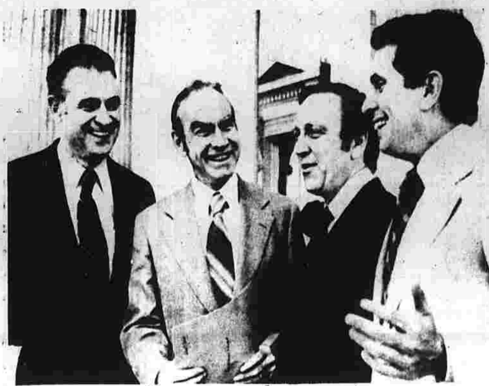
After arms embargo vote