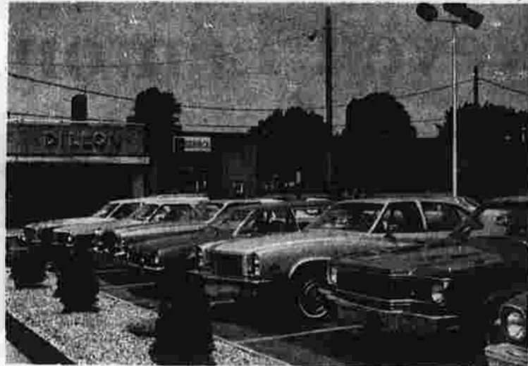
Dillon Ford's new lot

Dillon Ford at 319 Main St. has opened a new display area in conjunction with its 45th anniversary in Manchester. The new area next to Dillon on Main Street features new and quality used cars. Dillon employs five salesmen.