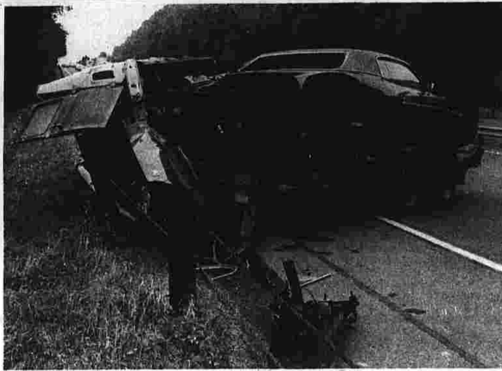
Blowout on trailer caused crash

The two occupants of the van towing this utility trailer and car were not injured late Tuesday morning when the van flipped over on its side on Interstate Highway 86, between exits 92 and 93. State police said a tire blowout on the trailer caused the operator to